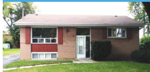
Bungalow In Desirable Location

8 Lovering Road - Sold 8% over asking! Highest price paid again! Attention builders/renovators - 3 bedroom bungalow on mature lot in high demand area. Build your dream home or renovate. Asking $599,000