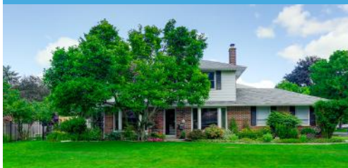
Renovated Conservation 4 Bedroom

1 Southdale Drive - One of the highest prices ever paid for an Alcan home in the Conservation Area. Gorgeous 4 bedroom home in desirable Milne Conservation Area, steps to famous Roy H. Crosby P.S. Asking $829,000