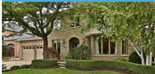
Stunning Glen Abbey 5 Bedroom

1347 Greeneagle Drive - Luxury at its finest... Located in prestigious "Fairway Hills", backs onto the world-renowned Glen Abbey Golf Course! $350,000 in renovations (Buyer Broker). Asking $1,547,000