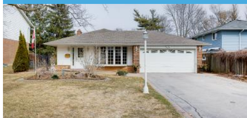
Updated Southdale Backsplit

4 Southdale Drive - Desirable 3 bedroom and 3 level backsplit located in sought after Milne Conservation Area, renovated eat-in kitchen, family room, walk to Roy H. Crosby P.S. and St. Pats. Asking $859,000