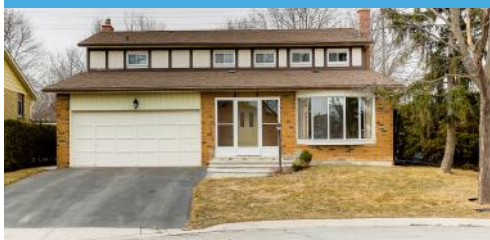
Large Bakerdale 4 Bedroom

50 Bakerdale Rd - Great value in desirable Milne Conservation area. This 4 bedroom home features over 2,200 sq. ft., finished basement and 50 Yr Steel Shingles. Walk to Roy H. Crosby and St. Pats. Asking $799,000