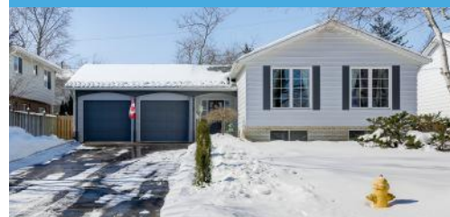
Updated Bakerdale Bungalow

4 Bakerdale Road - SOLD OVER ASK - RECORD PRICE For an Alcan Bungalow, Must See! Gorgeous sun filled. Large windows, hardwood floors and access to double garage. Walk to Roy Crosby. Asking $829,000