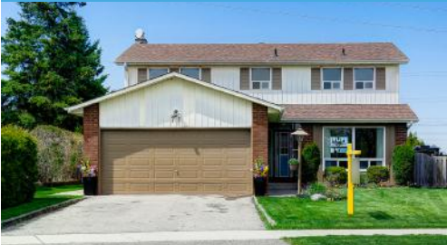
Charming Agincourt 4 Bedroom

71 Delburn Drive - SOLD! - Rarely offered 4 bedrooms, same owner for 39 years! Perfect for growing family, private backyard retreat with pool backs to field. Main-floor family room.