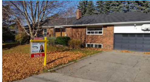
Conservation Bungalow 100' Lot

16 Riverview Avenue - SOLD - ANOTHER RECORD SALE PRICE. Attention Builders and Investors: Large Conservation bungalow with 100-lot. Steps to Milne Conservation Area and Crosby School.